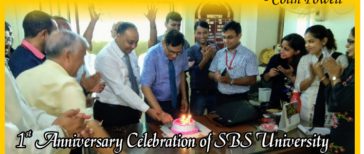
1 st Anniversary Celebration of SBS University